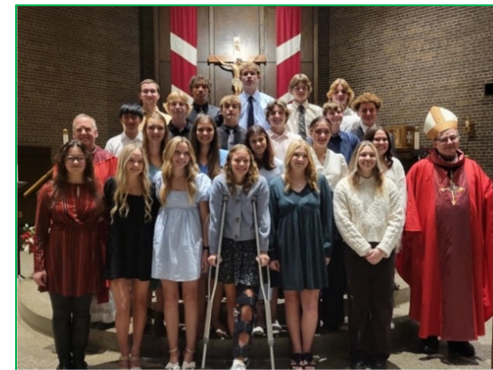
Immaculate Conception and St. Patrick Confirmation – 2023