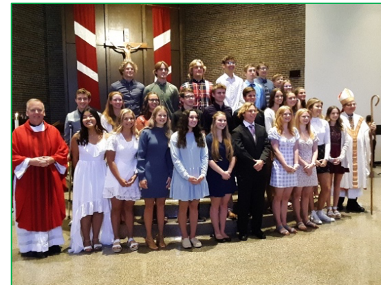
Immaculate Conception and St. Patrick Confirmation – 2021