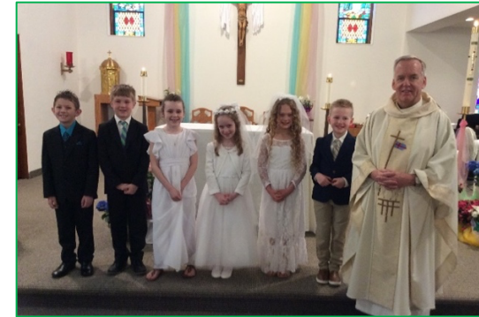
St. Patrick First Communion – April 2022