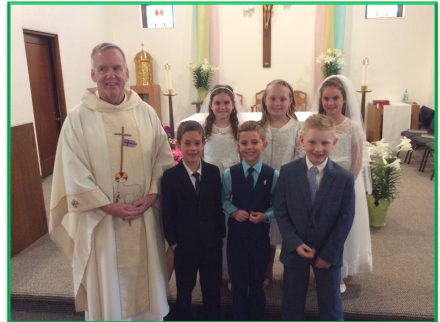
St. Patrick First Communion – April 2023